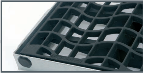
EPDM hinge protector to stop dirt and concrete ingress around hinge.