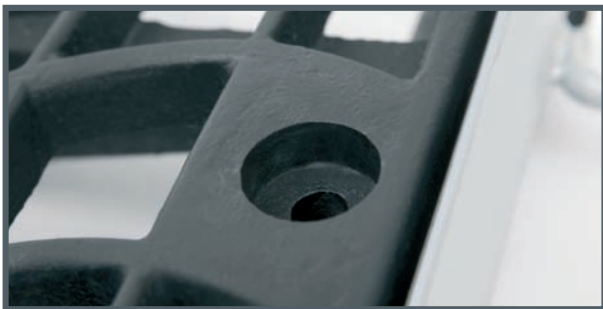
Counter sunk recess for stainless steel bolt down.