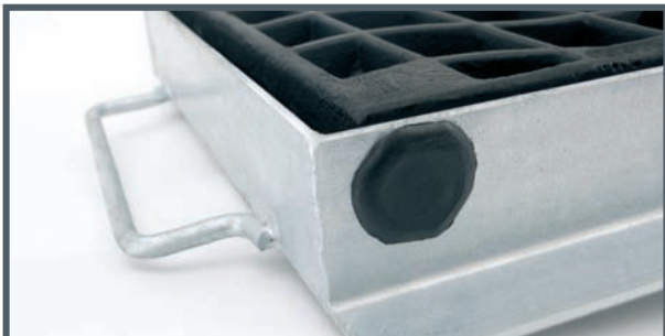
Large bar grips for easy handling and encasement.