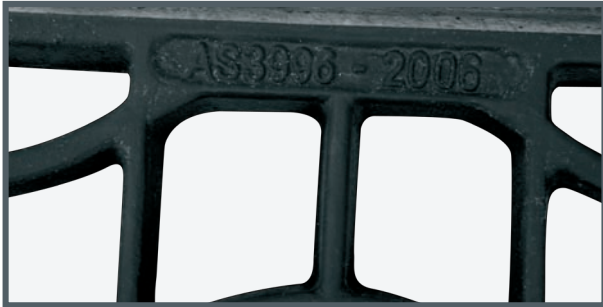
Cast iron or galvanized wave grate to AS 3996-2006.