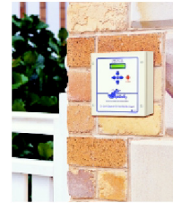
Advanced technology control panel will save you money

Adjustable settings and historical data are stored in battery supported memory and are accessible via the user friendly Liquid Crystal Display and keypad. Once again putting Icon-Septech at the forefront of modern technology!